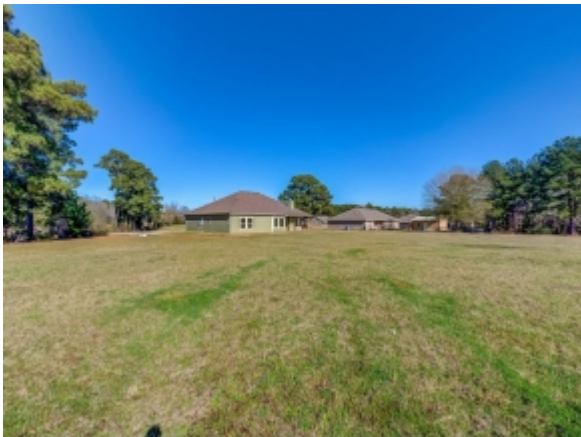
109 Woodside Drive $234,000