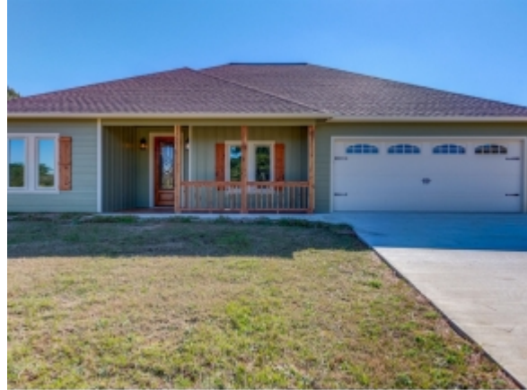
The 1/2 Guest Bath off Living