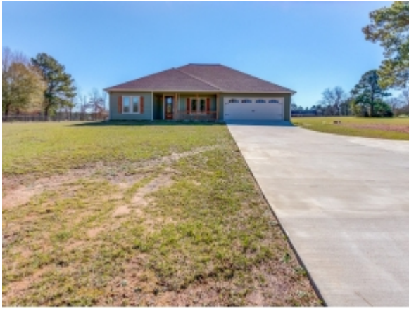
Close Up of Woodside