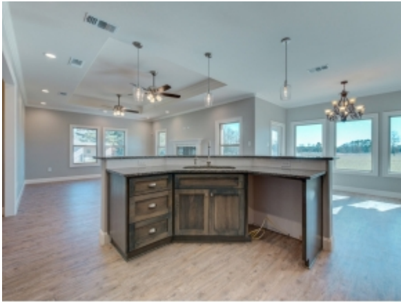
Open to Dining