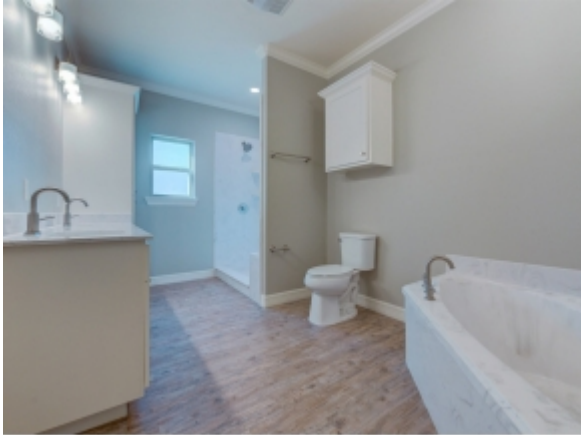
Master Bath w/Tub & Shower