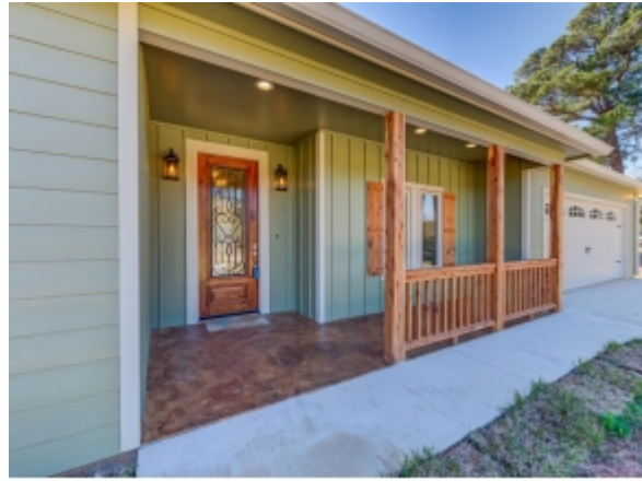
Side Porch Angle