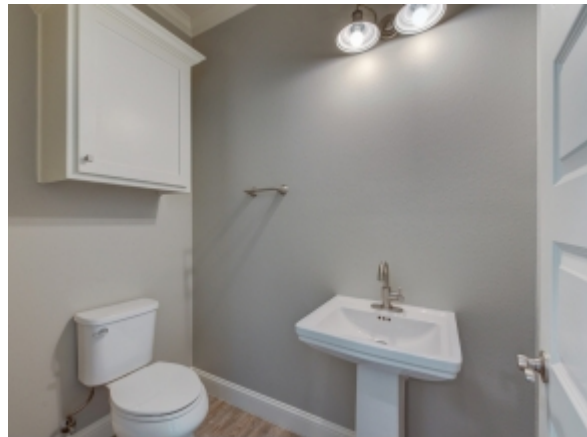
Two Lots on 1.87 Acres

--- Information herein deemed reliable but not guaranteed --- -01/14/2019 11:56 AM