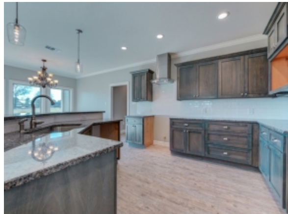
Custom Kitchen- Beautiful

--- Information herein deemed reliable but not guaranteed --- 01/14/2019 11:56 AM