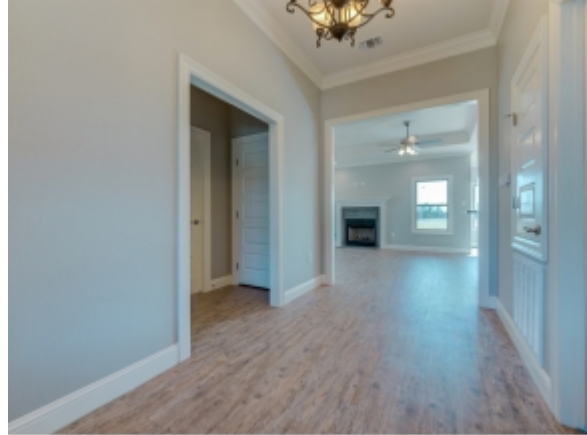
Roomy Wide Entrance